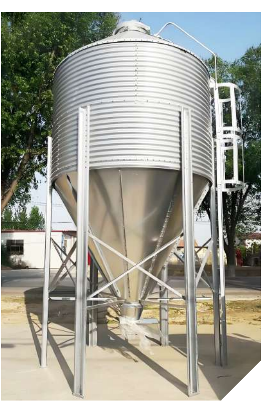
Commonly used in medium and large-scale farms, feed mills, and food processing plants